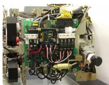
New 300 Manifold SMC Style Ass'y

The OS2000 is a complete replacement of the control system in the Micralign<sup>TM</sup> 5/6/700-series microlithography tools. The current OS, AFA, Sequencer, SEMI, and AIM computer and software systems are replaced by a single Windows<sup>TM</sup> based object-oriented computer and software control system. Some features include: LCD/Touch Screen User Interface; Pre-Process Checking; Automatic Process Loading and many, many more. There are over 75 OS2000 systems currently in the field. Contact us for more information!!!